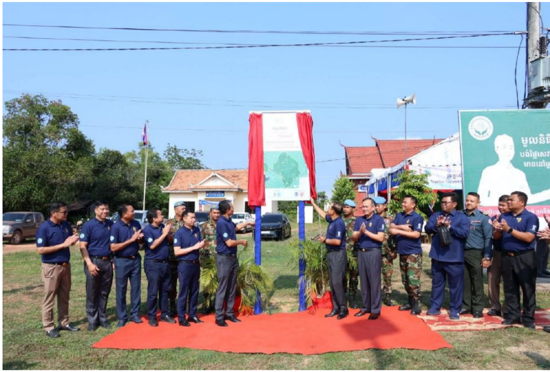
The declaration of Trapeang Rung commune, in Koh Kong province, was declared mine-free on April 2. CMAA

Trapeang Rung commune, located in Koh Kong province's Koh Kong district, was officially declared mine-free today, April 2.