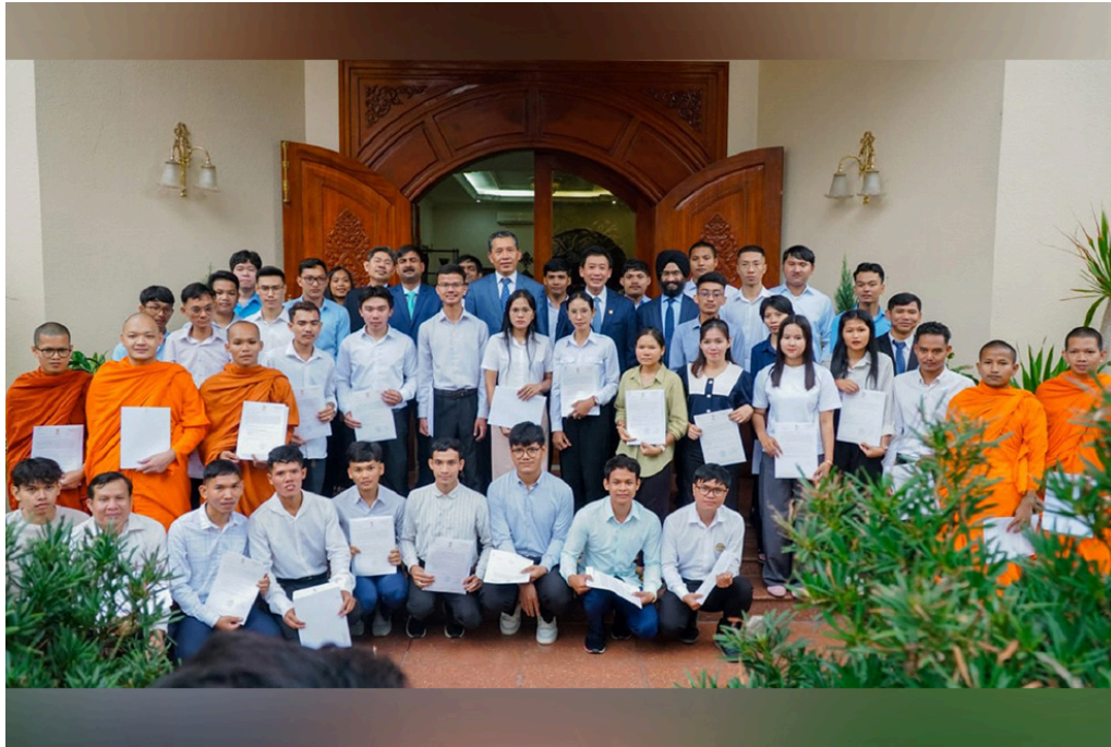
The Indian government has awarded 41 Cambodians full scholarships to pursue their higher education in India. Indian embassy

The Indian embassy in Phnom Penh hosted a July 16 event to award Scholarship Offers from the Indian Council for Cultural Relations (ICCR) to 41 Cambodian recipients. They will embark on their studies in India in the near future. The embassy described the scholarships as a significant step in strengthening educational ties between the two nations.