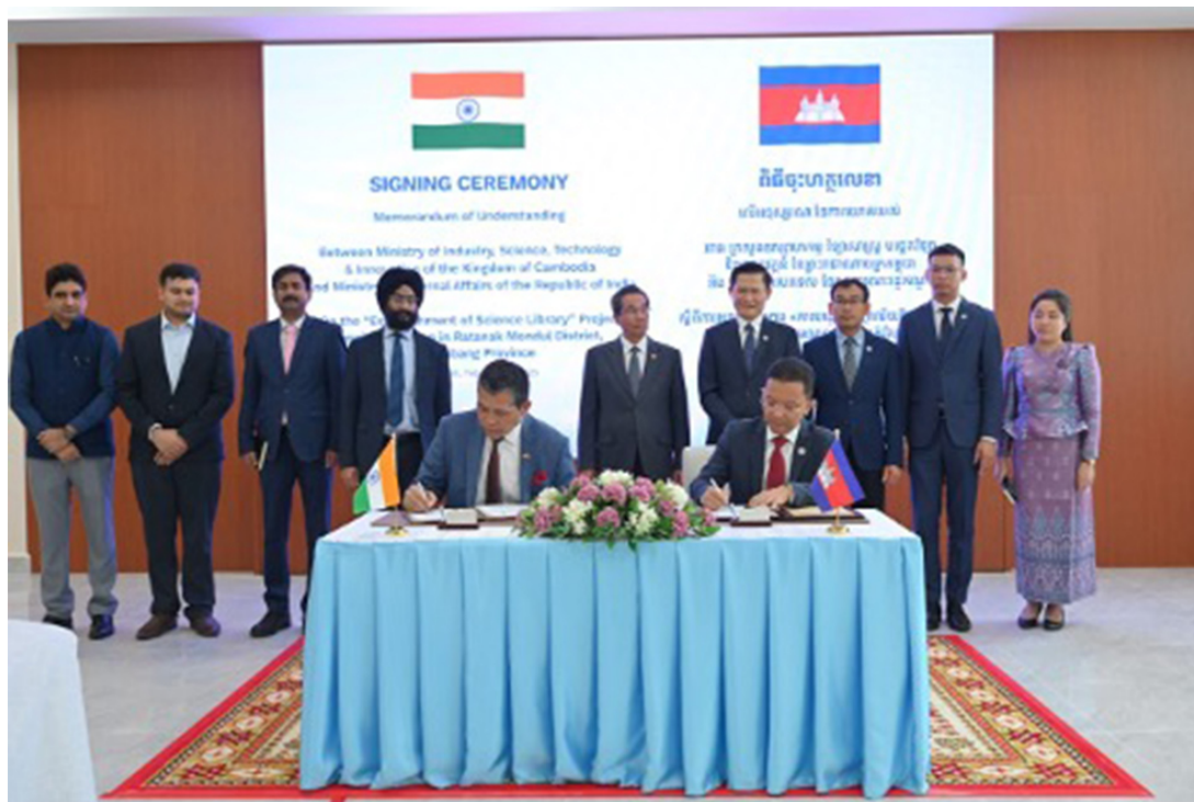
A February 17 signing ceremony between the Indian embassy in Cambodia and the science ministry will see a new science library established in Battambang province. Indian embassy

The Indian embassy in Cambodia has announced the implementation of a “Quick Impact Project” which will establish a new Science Library in Battambang province’s Ratanak Mondul district.