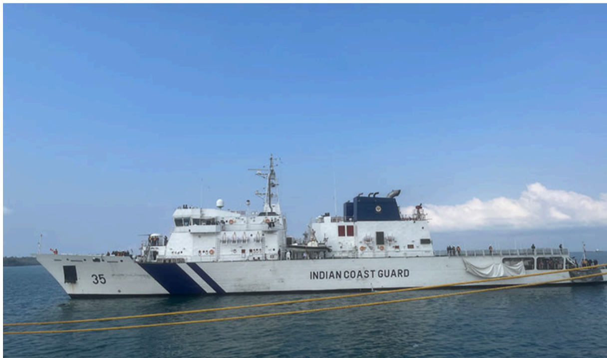
The 'ICGS Veera' which along with the 'INS Sujata' docked at Sihanoukville Autonomous Port on Friday.

Click here to get Khmer Times Breaking News direct into your Telegram